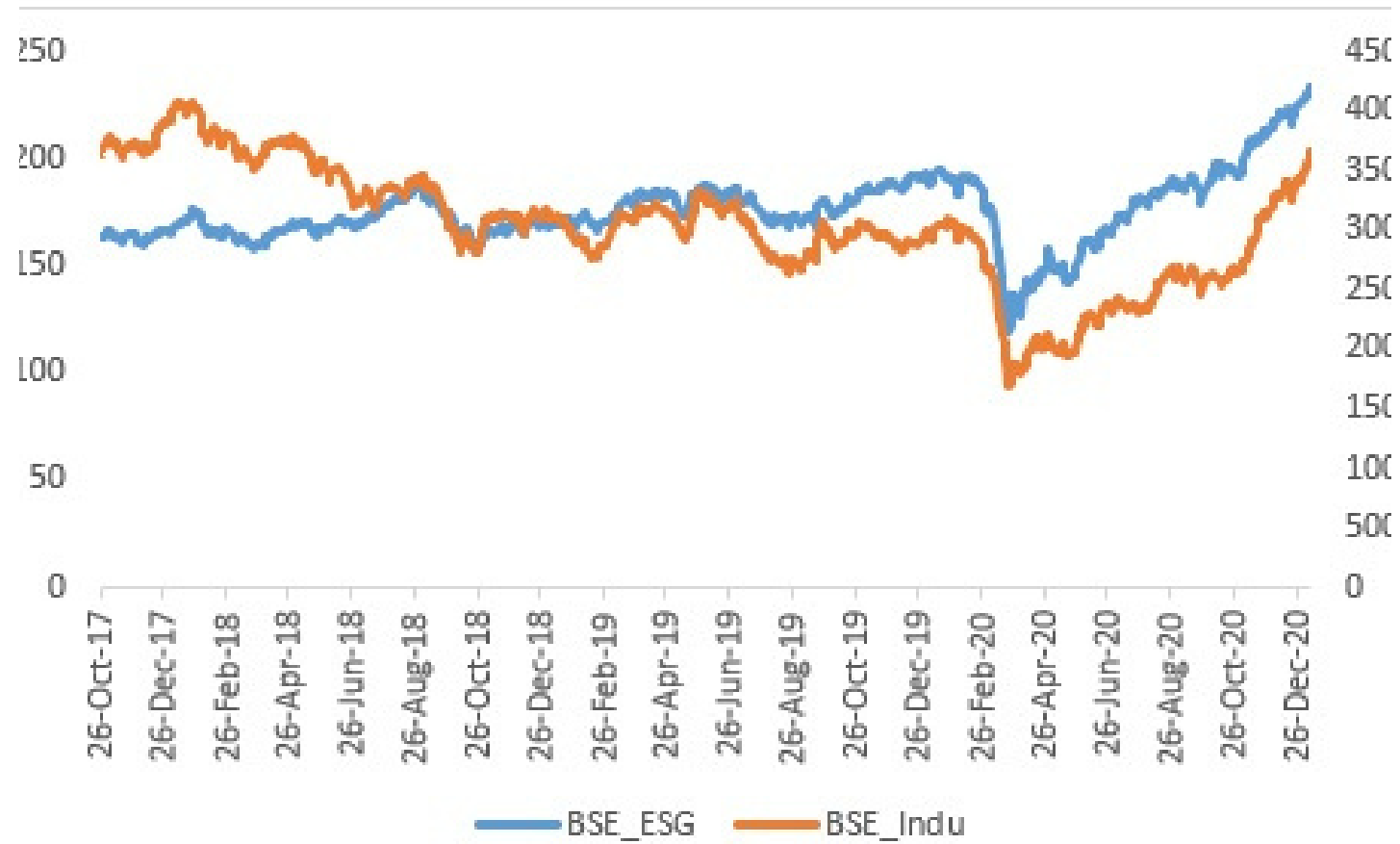
Figure 1: Daily closing prices of BSE ESG index vs. BSE Industrial Index