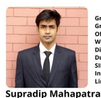
Graduation Stream- Bcom Graduation College-University Of Calcutta Work experience-Organ Diagnostic Centre, Kolkata Duration-48 Months SIP Organisation-Pramerica Life Insurance Company Limited(DHFL)