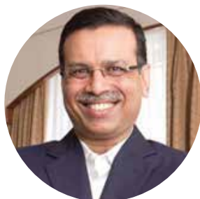
Shri Sanjiv Goenka